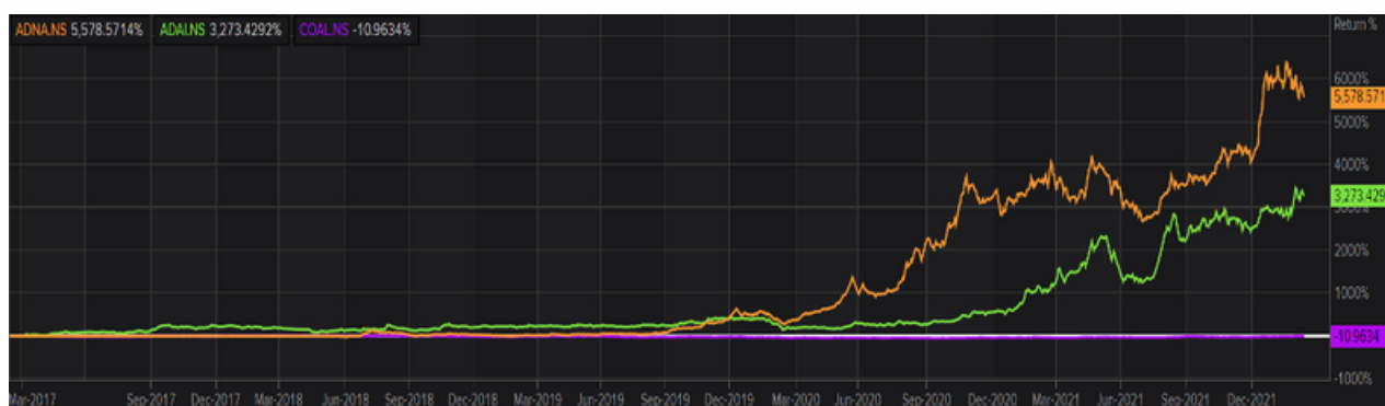
FIGURE 5: SHARE PRICE PERFORMANCE OF ADANI GREEN, ADANI TRANSMISSION AND COAL INDIA

The profit maximisation principle and the desire to avoid high emissions stranded assets guides investor decisions, and outlays will be directed towards areas with better chances of returns. The chart below shows the total return (share price + dividends) comparison between Coal India, Adani Transmission and Adani Green. Over the last five years (15 March 2017-15 March 2022), while Adani Green and Adani Transmission have given astronomical returns of 5,579% and 3,273% in the renewable energy generation and transmission businesses respectively, Coal India has destroyed shareholder wealth by generating ~-11% returns during the same period.