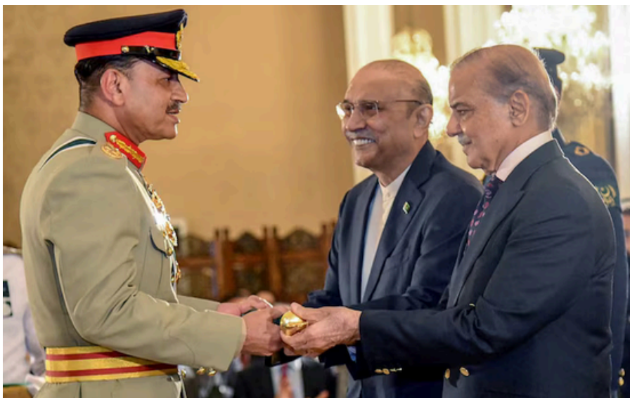
Pakistan's Prime Minister Shehbaz Sharif (R) and President Asif Ali Zardari (C) jointly conferring the Baton of Field Marshal on Chief of Army Staff General Syed Asim Munir during a ceremony at the country's President House on 20 th May 2025.

The 88-hour conflict in May and the broader crisis since April 22, unarguably expanded the space available for COAS Asim Munir to attempt changes of the system instead of simply within it. Historically, over the 34 years that the military formally ruled Pakistan, changes to the system usually entailed a complete takeover of power by vesting all executive authority in the Army Chief. This functionally meant that the Army Chief would serve either as Chief Martial Law Administrator or as President (usually one was a stepping stone to the other).