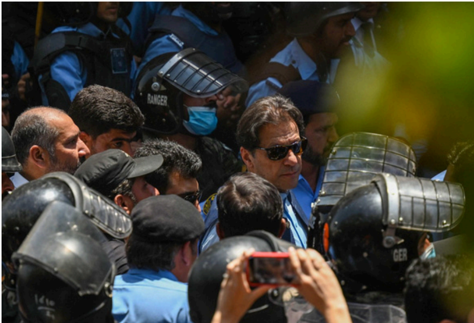
Policemen escort Pakistan's former prime minister Imran Khan (middle, with sunglasses) as he arrives at the high court in Islamabad on May 12, 2023.

By March 2026, the method employed by the Munir-led establishment to contain the PTI had become clearer... Today, Khan is arguably too popular to be sentenced to capital punishment and too empowered to be politically inactive in exile (he openly charges that Munir is ruling Pakistan through undeclared martial law).