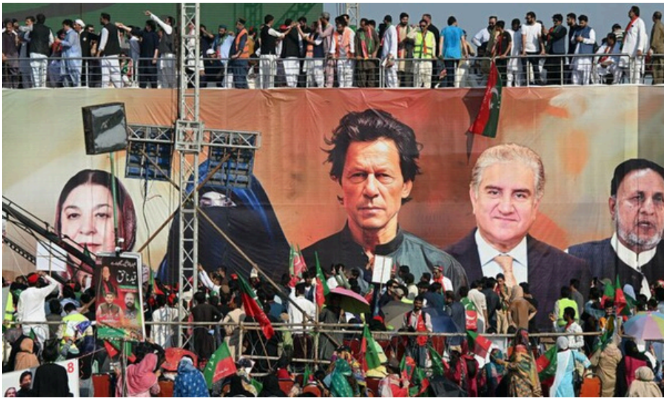
Activists of Pakistan Tehreek-e-Insaf (PTI) party of former country’s prime minister Imran Khan, take part in a public rally on the outskirts of Islamabad on September 8, 2024.

(IBOs) (even as IBOs themselves did not address the root causes of security issues in tribal areas). 48 It was also in 2024 that Munir’s public addresses revealed a more hardened approach against the gamut of perceived threats to the Pakistani state – internal militant groups, the Afghan Taliban’s sanctuary for such groups (for which he declared that “the whole of Afghanistan can be damned” for Pakistan’s security), 49 as well as the PTI-linked threat that continued to trigger street protests (especially in March, September, and November). Among these, the September 2024 protest led to a virtual shutdown of Islamabad, 50 suspending internet services and disrupting entry and exit points. The subsequent November protests featured a scaled-up iteration of the same event, with thousands arrested by the end of the year and several hundred injured. 51