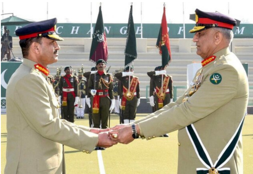
Outgoing Chief of Army Staff General Qamar Javed Bajwa hands over the baton of command over to the newly appointed Army Chief General Asim Munir (L), during a ceremony at the army headquarters in Rawalpindi, Pakistan November 29, 2022.

Munir himself inherited a Pakistan featuring a resurgence of insurgency by the BLA, attacks by the TTP (enabled by the return of the Afghan Taliban to Kabul in 2021), and – most importantly – a political leader who could draw on a cadre that was ready to mobilize on the street.