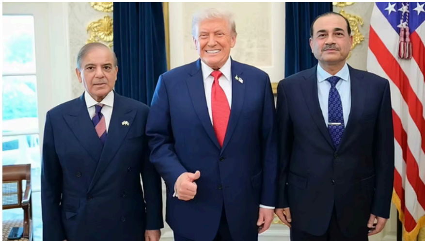
US President Donald Trump with Pakistan Prime Minister Shehbaz Sharif and Field Marshal Asim Munir at the White House in Sept 2025.

The functional aspects of Field Marshal Asim Munir’s formal centralization in the Pakistani state apparatus were proven early after his elevation to the five-star rank. While the COAS’s outsized domestic role is historic, Munir proved the uniqueness of his position by making the military the face of Pakistan’s foreign policy. Between May 2025 and April 2026, FM Munir participated in at least 15 meetings with foreign civilian and military leaders, both with PM Shehbaz Sharif present and without. 96 Among these, FM Munir’s private lunch meeting with US President Donald Trump on 18 June 2025 was the key springboard that legitimized his international status as de facto head of state, set a precedent in which Munir was accorded protocol near-equivalent to that of a President or PM, and further normalized his supersession of Pakistan’s existing state apparatus. 97 The substance of the meeting remains undisclosed, but Munir evidently used it to convince the US President of Pakistan’s military success over India in May. This was supplemented by Pakistan’s repeated expressions of gratitude to the US President for facilitating the ceasefire and its subsequent nomination of President Trump for the Nobel Peace Prize. 98