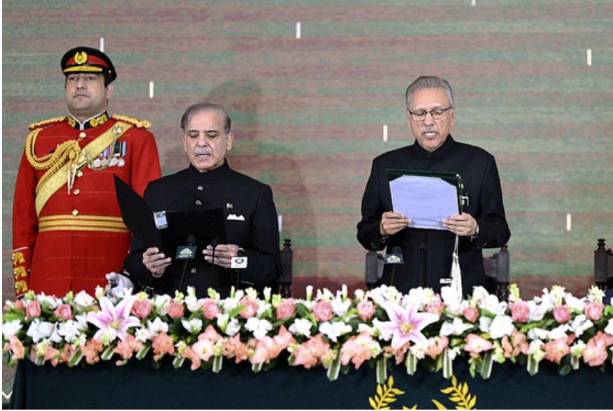
Pakistani President Arif Alvi (R) administers the oath of office to newly elected Prime Minister Shahbaz Sharif during a ceremony at the Presidential Palace, in Islamabad, Pakistan, in March 4, 2024.